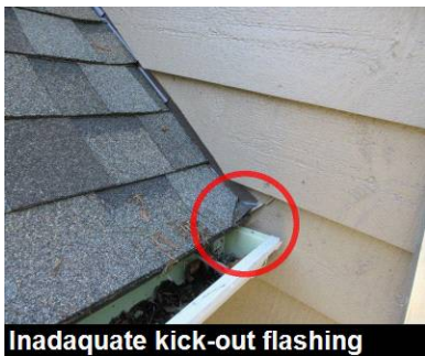
Inadaquate kick-out flashing

There is no kick out flashing at the roof edge to wall intersection above the gutter. This will allow water to enter the wall behind the siding. The installation of a kick-out flashing is recommended.