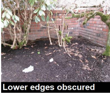
Lower edges obscured